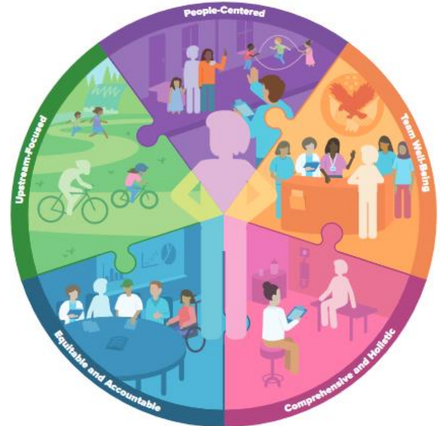
FIGURE 2-2 The foundational elements of whole health.